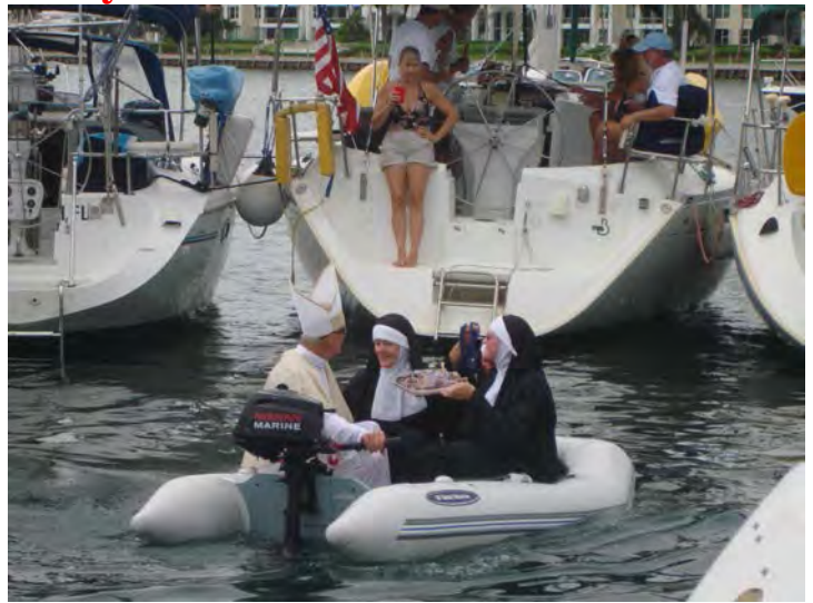
These people need a blessing ... I mean a Jello