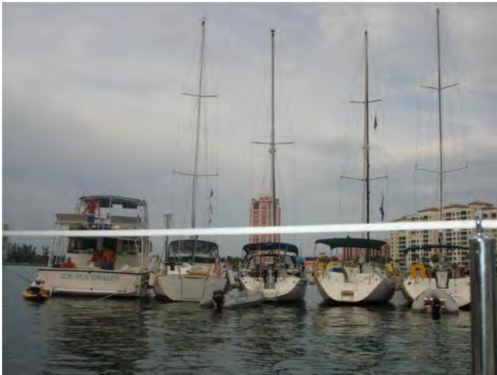
Good Morning!! All those pesky folk from Rome have gone