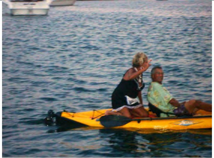
Everyone needs a maid